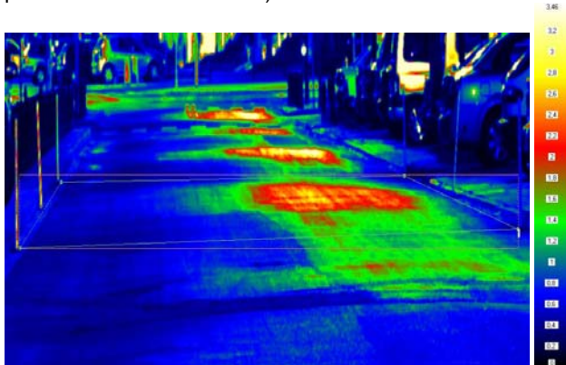
Pic. 3. Luminance distribution on Karmelicka street (for the left position of the observer).

Table 1 contains results of the measurements of: average luminance ( L_{sr} ), overall uniformity of luminance ( \delta_o ) and the longitudinal uniformity of luminance ( \delta_l ), as well as the average illuminance ( E_{sr} ) and its uniformity ( \delta_E ). Moreover, picture 3 presents luminance distribution on the street surface (for the left position of the observer) – the figure is accompanied by a luminance scale (on pseudocolor scale in cd/m 2 ).