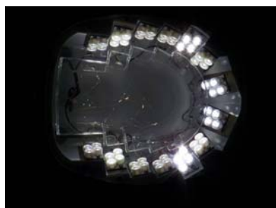
Pic. 1. View of the lighting frame modules with light-emitting diodes

As a result of cooperation of Zarząd Dróg Miejskich (ZDM) (Municipal Roads Authority) in Warsaw and Zakład Techniki Świetlnej (ZTS) (Lighting Division) of the Warsaw University of Technology, an attempt was undertaken to monitor the condition of lighting of a test lighting installation. ZDM chose new luminaires with light emitting diodes and selected the place of their installation – Karmelicka street in Warsaw. ZTS employees took to monitoring the condition of the lighting in the test fragments of the street at pre-determined intervals.