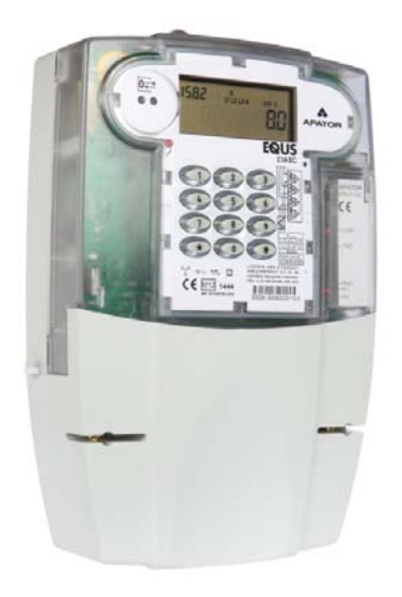
Fig.2. Smart electricity meter [9]

A smart electricity meter (Fig. 2.) is a basic element of the AMI and of its functionality affects the functionality of the entire metering system. The most important feature of this meter is the possibility of a two-way communication with the power system operator. The communication is implemented in the PLC technology via a built-in communication module, enabling the connection to a data concentrator. In justified cases, complement of the PLC transmission can be direct communication with the MDM via the GSM transmission.