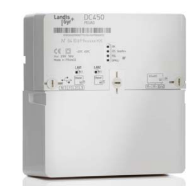
Fig.3. Measurement data concentrator [10]

A measurement data concentrator (Fig. 3.) connects customers' meters with the MDM. The main task of the concentrator is to download via PLC measurement data from meters, and then transfer them via Ethernet, modem and GSM to the power system operator. Most of the commercially available concentrators allow the use of an external or built-in modem.