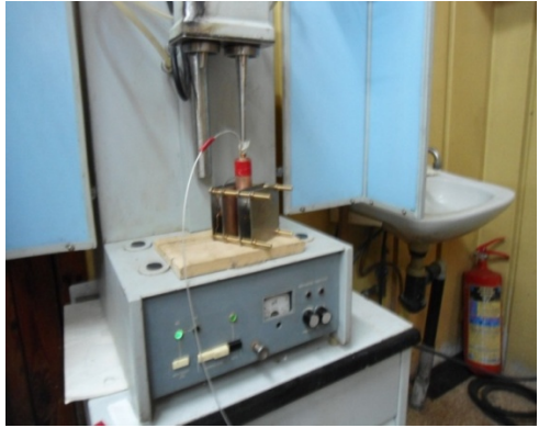
Fig. 3a. Appearance of measuring installation.

where as the approached values \rho \ u \ c were the density of water and speed of a sound in water are taken. For parameters of our installation from the formula (3) it is received: I_Z \approx 10^{-2} W/cm<sup>2</sup>. Values of the maximum speed ( v_{max} ) and amplitudes (A) of ions moving of a solution, and also pressure (P) of an acoustic wave can be received by means of the formula (2, 9 10, 7, 13) on the basis of the measured value of electrical voltage U_m .