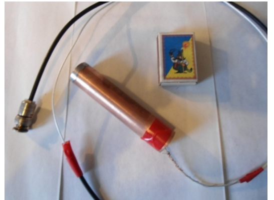
Fig. 3c. Appearance of a copper glass with established in it probes and connecting cable.