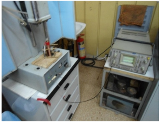
Fig 3b. General view of equipment with a selective microvoltmeter.