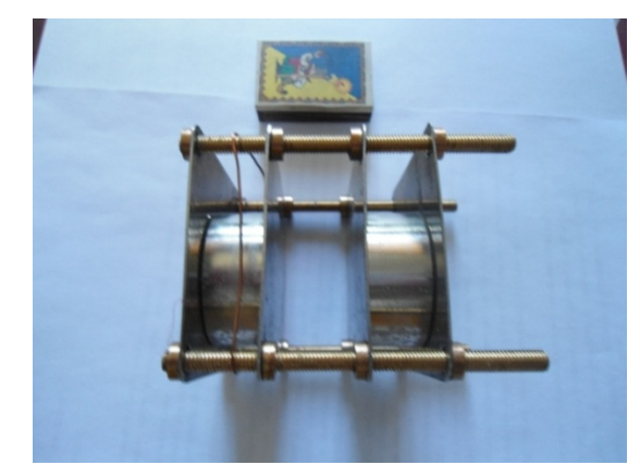
Fig. 3d. A photo of two constant magnets Nd-Fe-B with elements of their fastening.

The photo of two direct magnets fixed from each other by brass hairpins, providing a demanded backlash between magnets, in a Fig. 3d is shown.