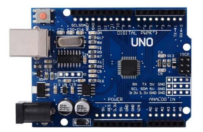
Fig. 3. The Arduino Uno microcontroller used in the aquarium controller model [5].

All components were equipped with the necessary sensors and probes as well as the necessary software so that the controller could receive information about their correct operation. The system also includes a water level sensor and a flood sensor, which inform the user if there is too much or too little water. During the design and construction of devices, the main consideration was their reliable operation, safety and low price. The most important feature was the possibility of full control of all necessary components by one device.