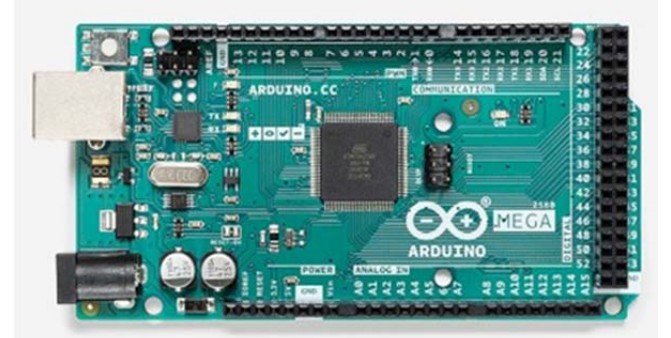
Fig. 1. Arduino MEGA 2560 microcontroller [4]

The smart home mockup was created using the ATmega 2560 microcontroller embedded on the Arduino Mega2560 Rev3 board (fig. 1), so it was necessary to program all electronic components in the Arduino environment [7].