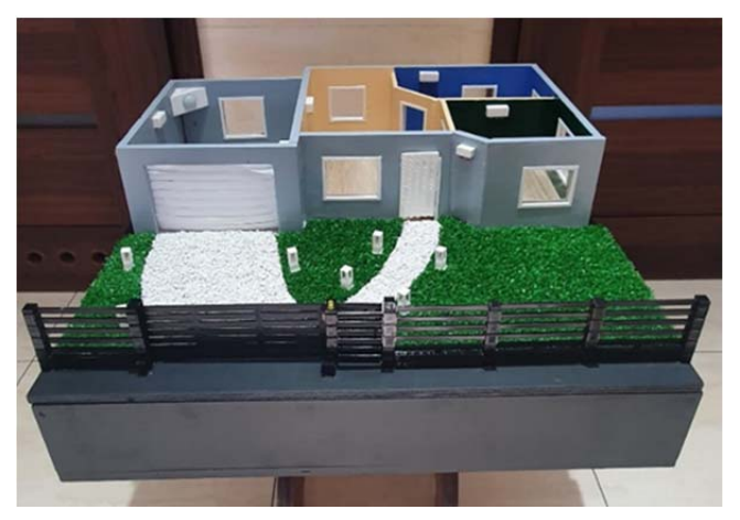
Fig. 2. The smart home project programmed in the Arduino environment wireless communication technology or add voice control.

The project is designed in such a way that it has the possibility of further expansion, for example it is possible to add window sensors or CCTV monitoring, or a remotely activated fountain. It is possible to transform