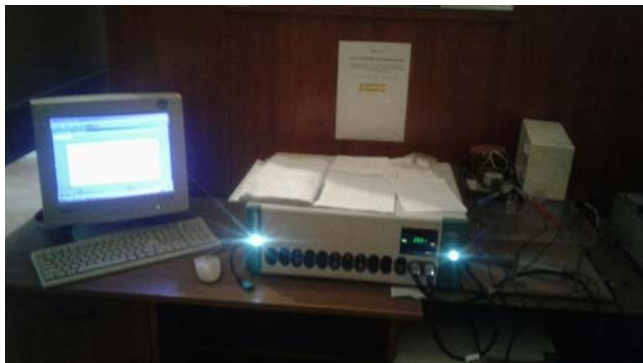
Figure 2. Laboratory installation of admittance measurements

element that is in direct contact with a physical quantity (its parameters) form an admittance sensor (primary transducer). Under the influence of the test signal parameters (level and frequency), it transforms a non-electrical physical quantity into an electrical quantity of a capacitive or inductive nature.